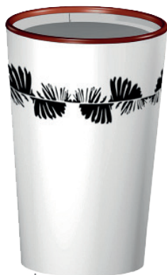
MARGUERITE URBAN VASE 0299 700 275 L - Ø670 x H1145 mm