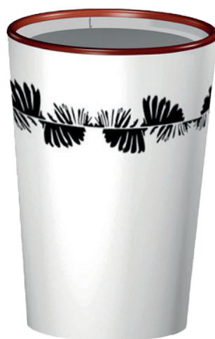
MARGUERITE URBAN VASE 0299 710 440 L - Ø800 x H1210 mm